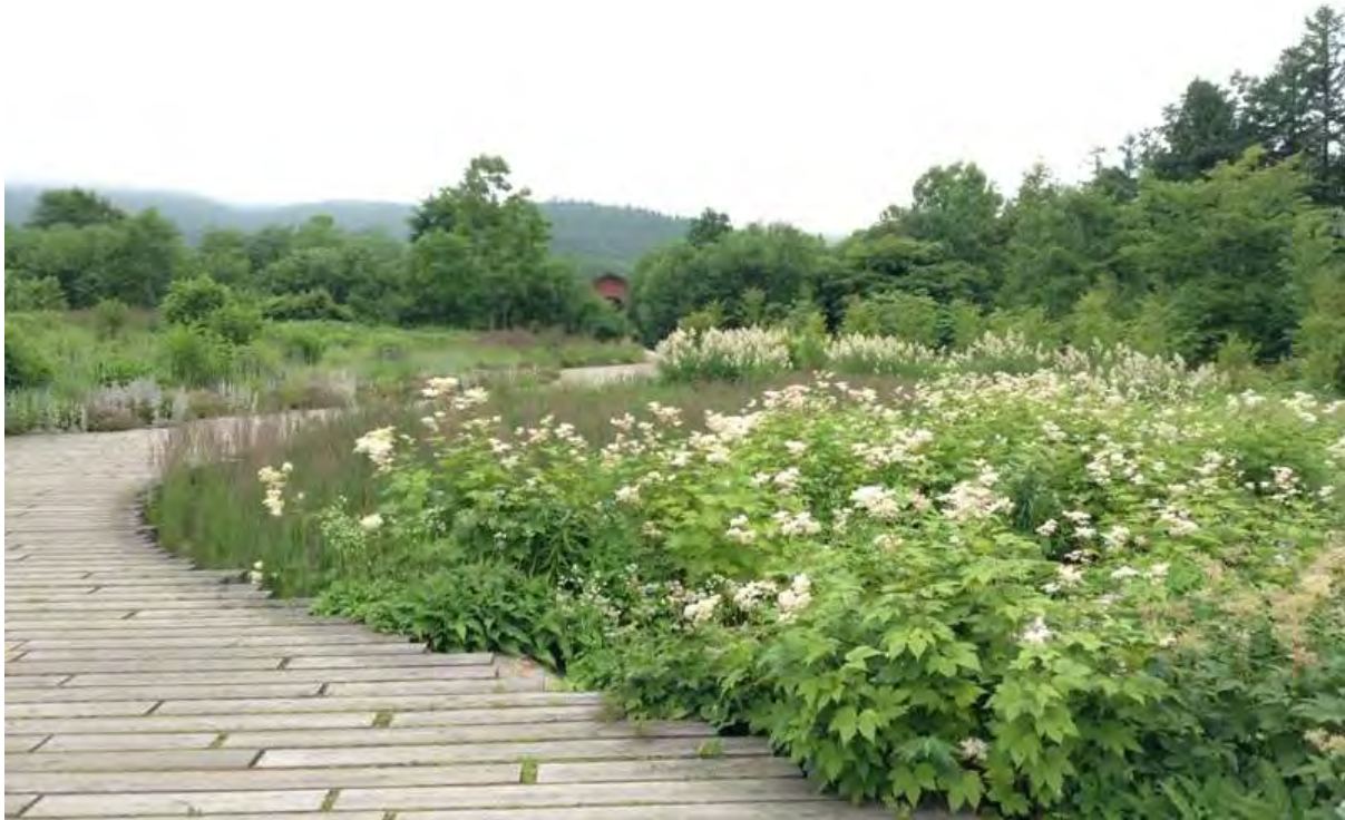
-The Meadow Garden, Tokachi Millennium Forest