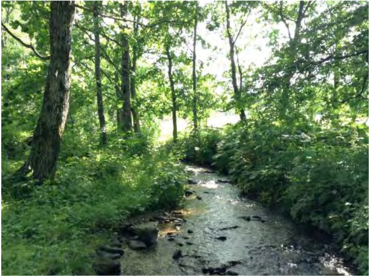
-A cold water stream cooling the forest