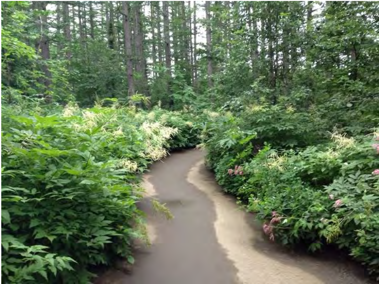
-Path through the forest, Aruncus diocis in flower

summary about each aspect of the forest project before going on to the additional relevant experiences like visits to native flora habitats and the gardens of Kyoto.