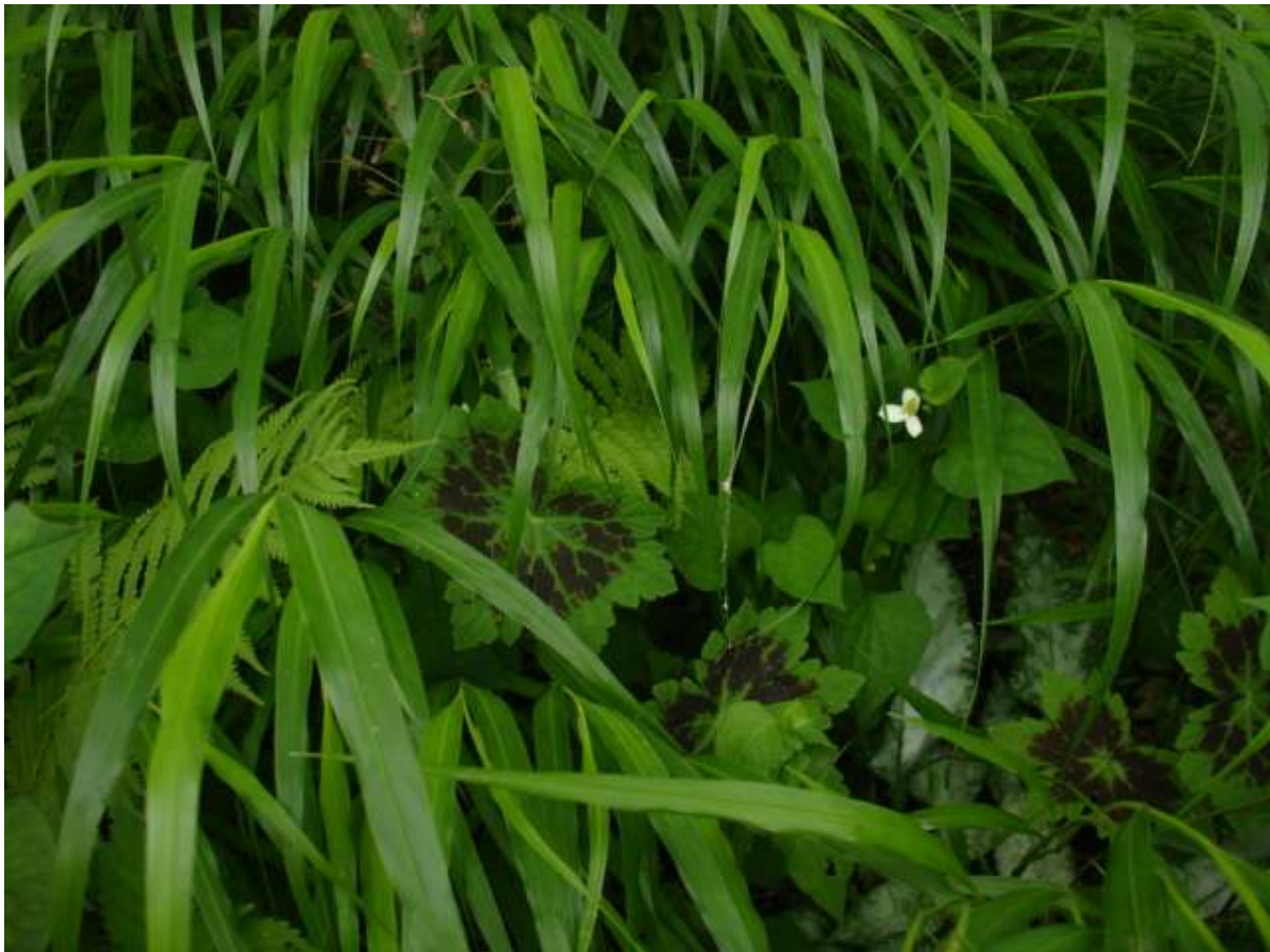
-Hakonechloa macro, Geranium phaeum, Pulmonaria and Houttuynia

grow over 6ft tall and 4ft wide, allowing those free rein all through the garden would result in a loss of views, only perhaps 8 clumps are necessary for the whole space. Whereas something smaller and stoloniferous like Houttuynia which though travels far and wide will potentially not out muscle it's companion Hakonechloa but maybe would Pulmonaria. So constantly the gardener is required to learn about the plants, who is strongest, who needs checking and who needs support by making a small bit of breathing space. The garden therefore is managed for an aesthetic balance, but why not when the houttuynia runs into a certain neighbouring mix, isn't it let to go? Midori's most adequate answer was that then all intent of planting combinations dissipates. But I believe that is true in certain circumstances but never always and perhaps if Midori and Dan were working everyday together I no doubt imagine the garden would have evolved far beyond it's first, possibly restrictive beginnings.