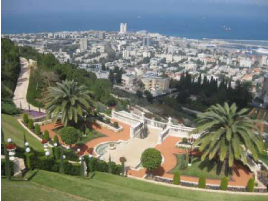
View of Haifa from the terraced Bahá'í Gardens

Haifa's urban landscape is dominated by the golden dome of the Baha'i Temple, set in formal gardens which frame panoramic views of the city.