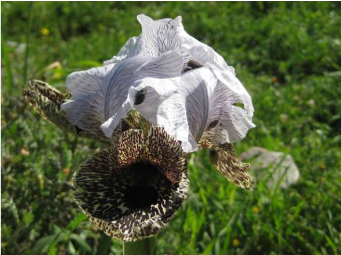
Endangered native Iris bismarckiana

We were very fortunate to see the beautiful Iris bismarckiana flowering here. A rare species, following a recent decline, I. bismarckiana is now limited to a few populations in Israel with only a single population protected in a nature reserve 4 .