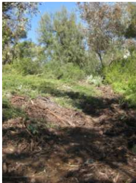
South West Australian sub-section, before and after!