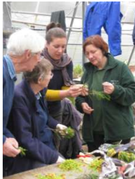
Taking Softwood Cuttings, JBG