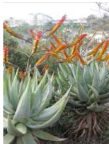
Aloe marlothii , JBG