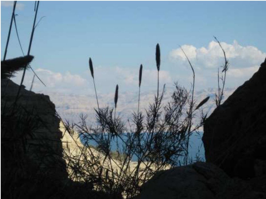
View across the Dead Sea (at some 400m below sea level, the lowest place on Earth) to the hills of Jordan, from En Gedi Nature Reserve

A growing population, urbanisation and increasing industrial development in Israel is destroying the country's natural habitats and propelling biodiversity into a decline. The State has responded by pronouncing a fifth of its land area as nature reserves.