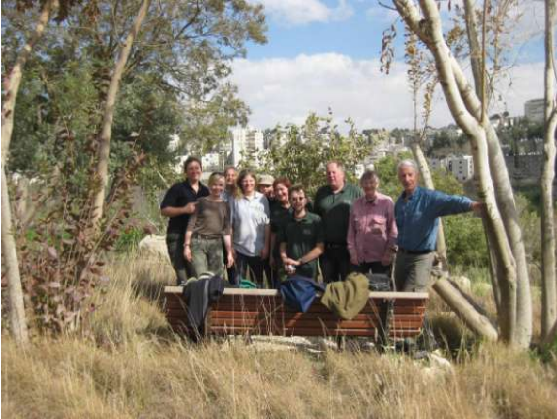
Working Holiday Group, JBG

I spent two wonderful weeks in Israel with eight other participants, working at JBG, touring the country to visit other gardens, to see the native flora and the some of the many historic sights.