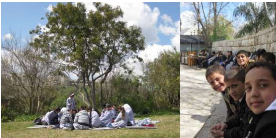
Outdoor learning opportunities, JBG

The initiative shows that horticulture is a discipline which has the potential to bring people of different backgrounds together and points to the garden as an ideal setting for reconciliation; in a country like Israel, the project offers hope for a more peaceful future.