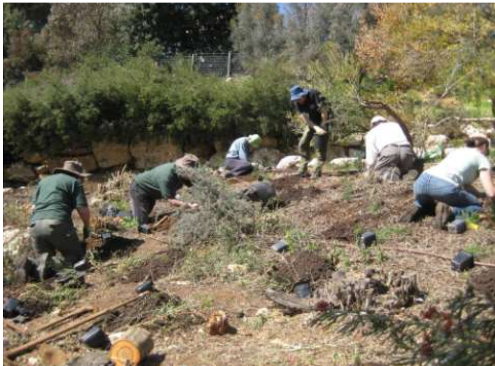
Working Holiday Teamwork, JBG

We made planting holes using mattocks, which penetrated the hard ground better than hand trowels or border spades. Once planted, we put a felt collar around the plants to protect their stems from the bark mulch.