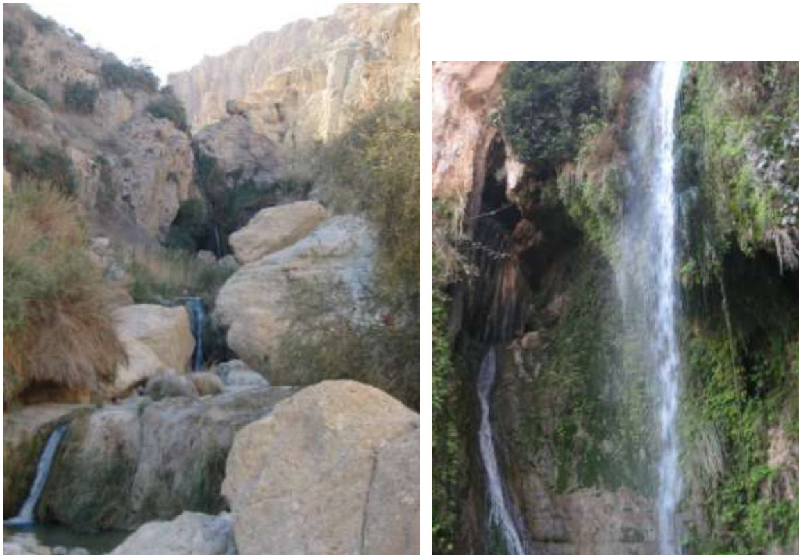
Wadi David (Left) leading to David's Fall (Right).

We also saw wetland vegetation including Arundo donax (The Cyprus Cane), lichens and ferns, such as Adiantum capillus covering the rocks by David's Waterfall at the head of Wadi David (below).