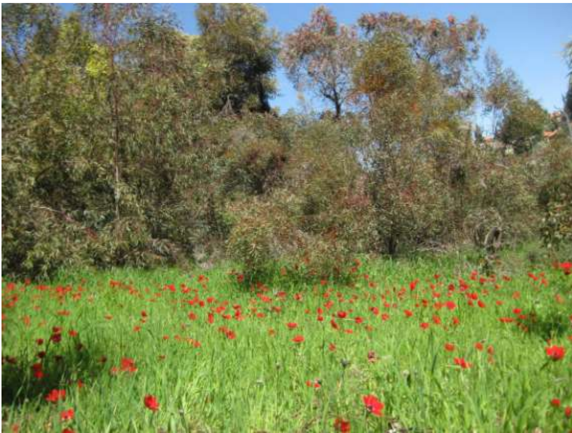
Anemone coronaria in Eucalyptus Scrub, JBG