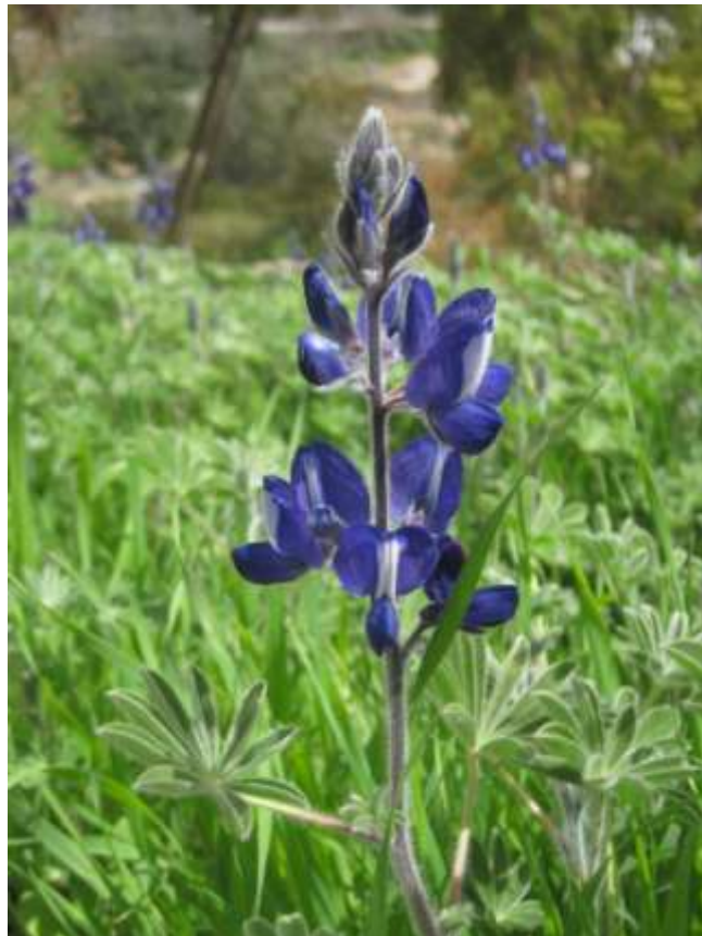
Lupinus pilosus (plants grown from seed collected from a wild population in northern Israel, JBG)

JBG has a key role in conserving Israel's plant biodiversity, so my third objective for the trip was to learn more about the native flora of Israel and conservation efforts to protect native and endemic plant species in the region.