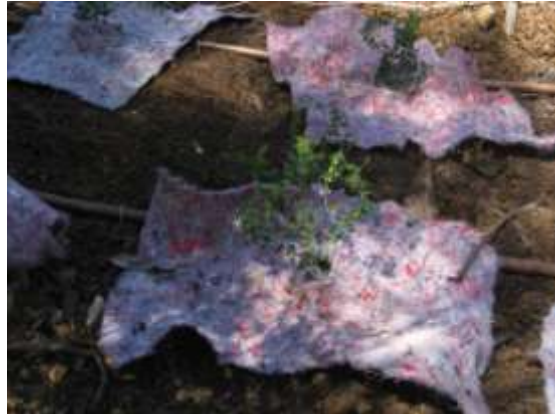
Irrigation pipes are used widely at JBG Felt collars

We made planting holes using mattocks, which penetrated the hard ground better than hand trowels or border spades. Once planted, we put a felt collar around the plants to protect their stems from the bark mulch.