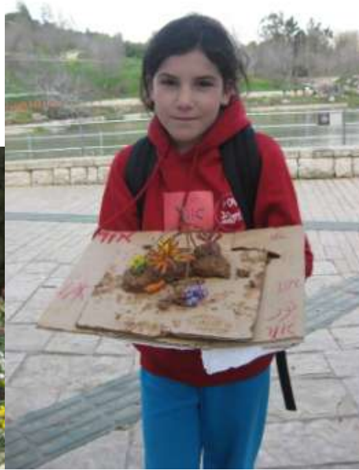
Plants of the Month Display, JBG School-aged girl with own garden, JBG