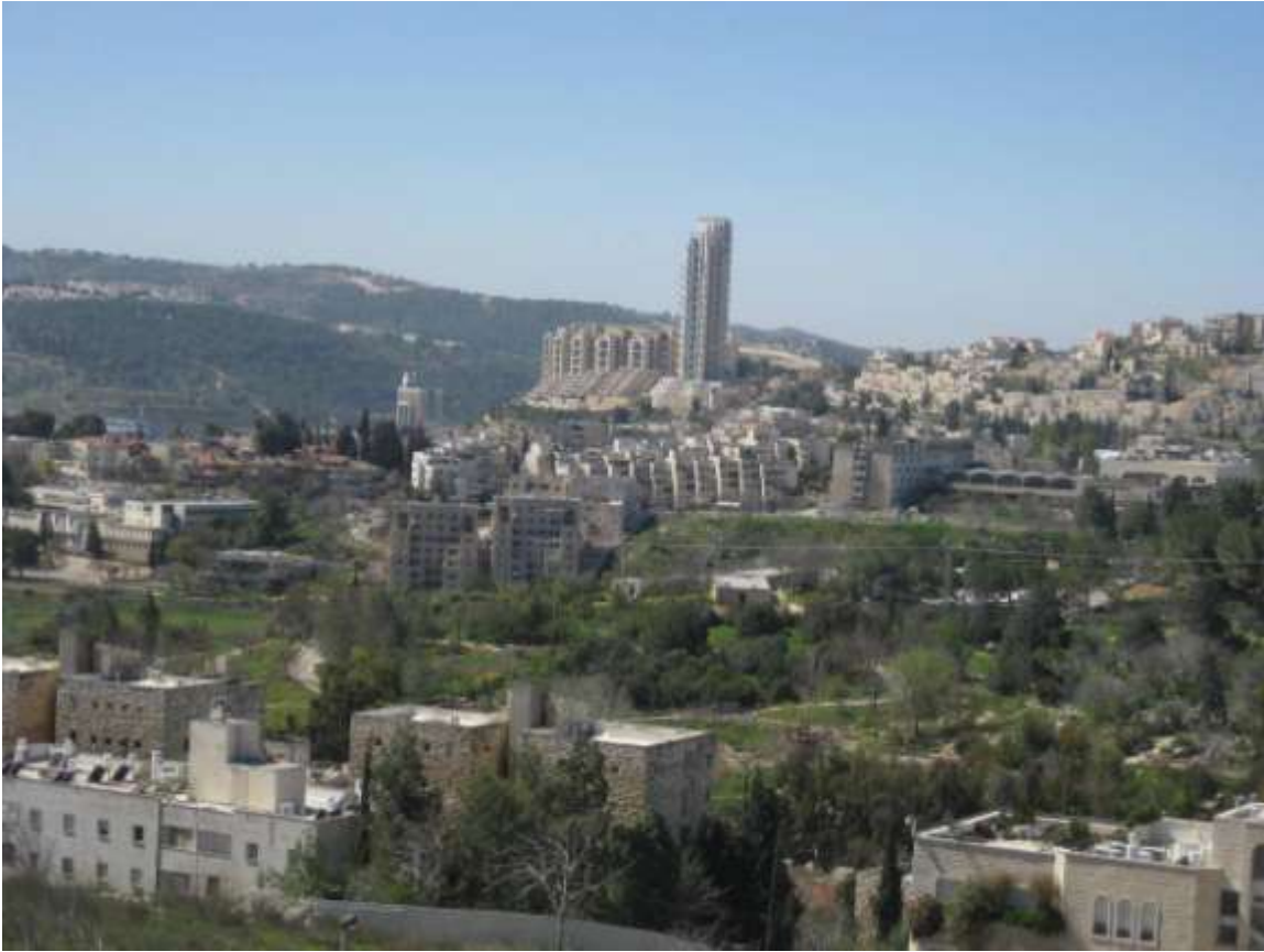
View of JBG with the hills to the west of Jerusalem in the distance

Compared to similar gardens in the UK, JBG is managed on a very small budget by the Botanical Garden Association ( a collaboration between the City of Jerusalem, the Jewish National fund, the Jerusalem Foundation, the C.G.Fund and the Society of Friends of the Botanical Garden).