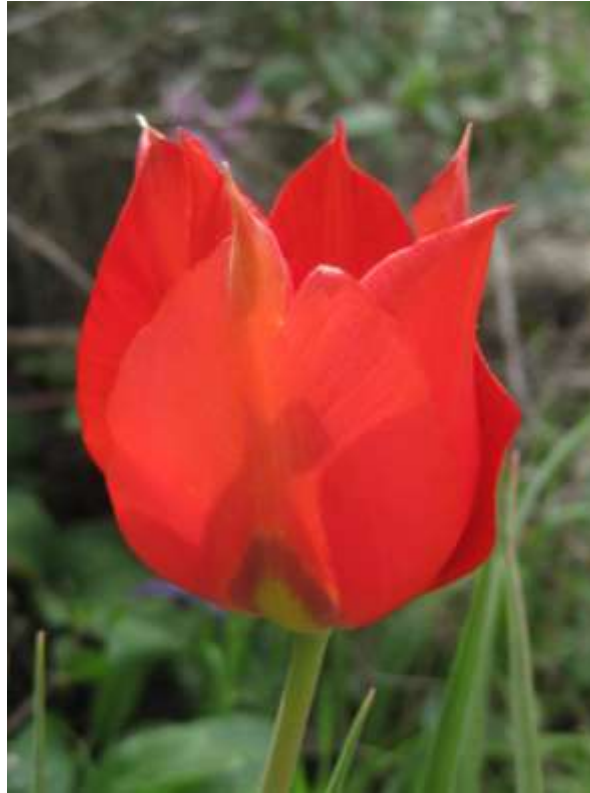
Tulipa agenensis (details below)

Another botanical high-light of my trip, was seeing the native Tulipa agenensis growing in large numbers in Mediterranean woodland, in the mountains to the west of Jerusalem. Tulips are such popular ornamental plants in the UK; I gained a really useful insight into their cultivation requirements by seeing these wild populations, growing on the grassy banks and in rocky places, in the dappled shade of the pine forest.