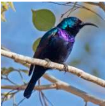
Nectarinia osia (stock photo)

Most of the vegetation consists of grasses and sparsely distributed trees that shed their leaves during the dry season. Trees such as species of Zizyphus and Acacia albida are ubiquitous. Succulents, including many species of Aloe , are represented in the South African section at JBG and attract the nectar seeking Palestinian sunbird.