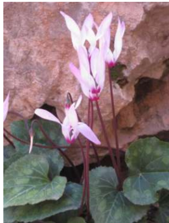
Cyclamen persicum (Israel's National Flower)