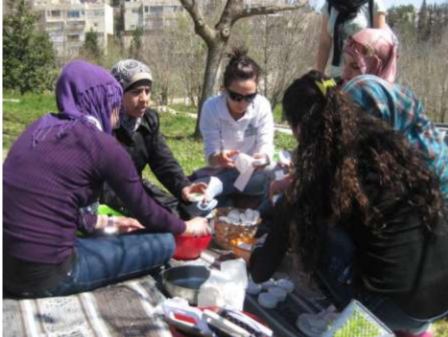
Young Muslim Women making gel out Aloe vera