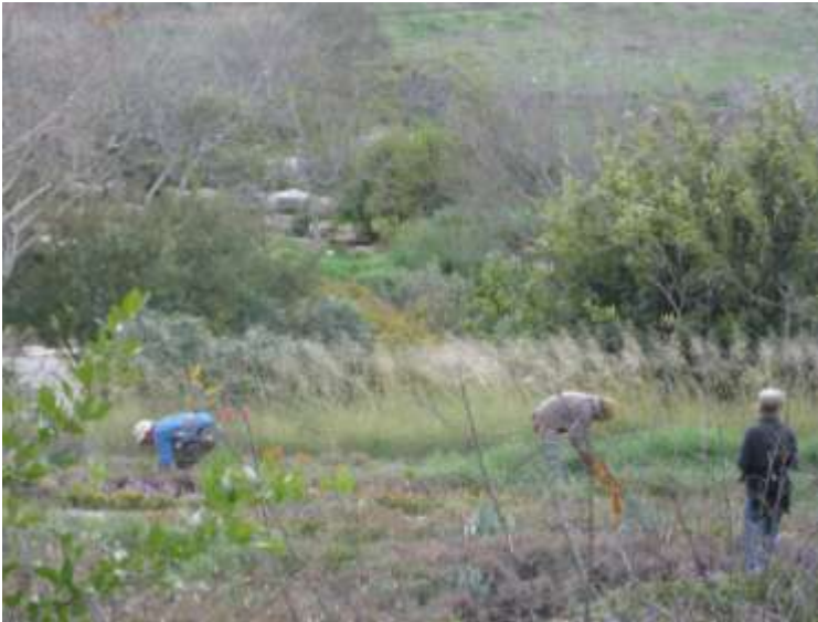
Savannah Flora and Bush Deserts, JBG

We also worked in a sub-section of South Africa which focuses on Savannah Flora and Bush deserts. I learnt that this type of flora occurs in the northern part of South Africa, on the country's vast central plateau; a dry, continental region characterised by seasonality and summer rains, where fire constitutes an important ecological factor.