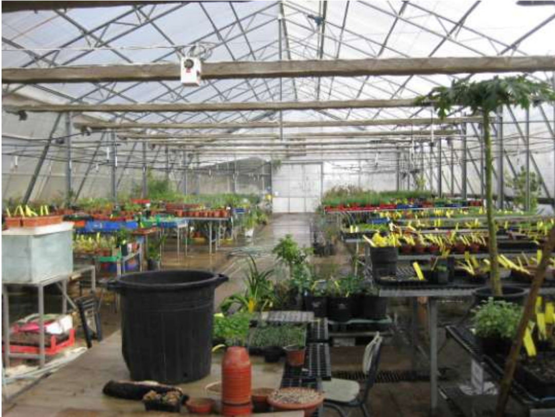
Glasshouse at JBG

Heavy rain during our first week meant that we spent several days here taking cuttings and sowing seeds.