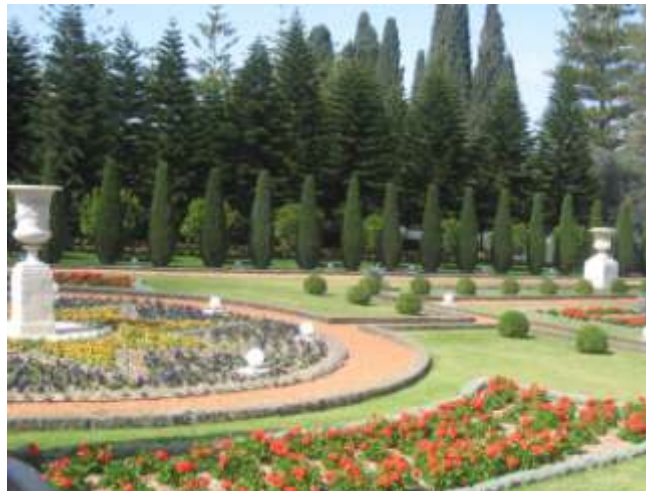
Formal Bedding schemes made us Brits feel at home!

The Shrine of the Báb (the resting place of the Prophet of the Bahá'í Faith) stands on the central terrace, looking across the bay towards the crusader town of Akko. Formal flower beds in geometrical shapes, intersected by gravel paths and clipped hedges, are the dominant elements in this restrained, manicured garden which aims to reflect the tranquillity and uplifting spirit of Haifa (the administrative and spiritual heart of the Bahá'í community) 3 .