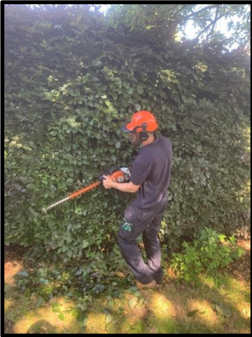
Cutting a beech hedge.

I fulfilled my interest in machinery experience as I managed to use almost every tool and vehicle in the workshop before my time was up. Using big ride-on mowers, loader tractors and gators made it a very enjoyable experience for me.