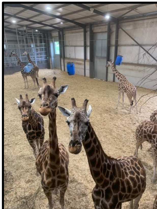
Perks of the job.

Whilst at the safari park I experienced a completely different way of thinking about horticulture. Considering the needs of animals from around the world and replicating environments was something I had never done before. Considerations towards members of the public using the park also had to be made which gave me insight into the process behind planting in a public space compared to private.