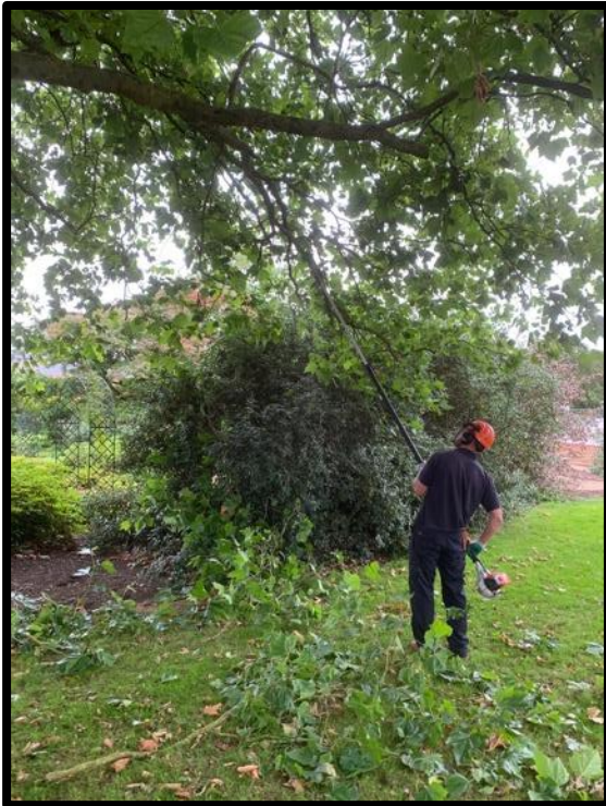
Crown lifting with a pole saw.

During my time there was some tree work to do, including crown lifting and branch pruning with pole saws. There was also a large tree fell which I got to observe and learn from and then be involved in the clear up. Taking the opportunity to get a taste of arboriculture on placement was well worth it as I have now realised it is an area I would like to learn more about and potentially pursue.