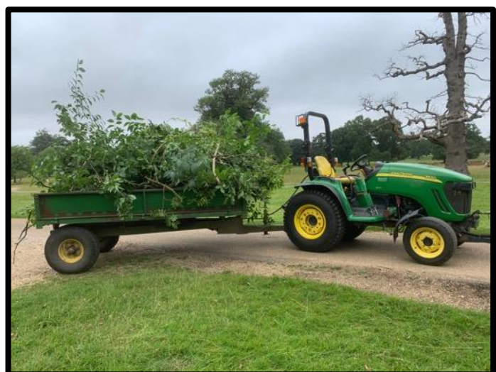
Tree clear up.