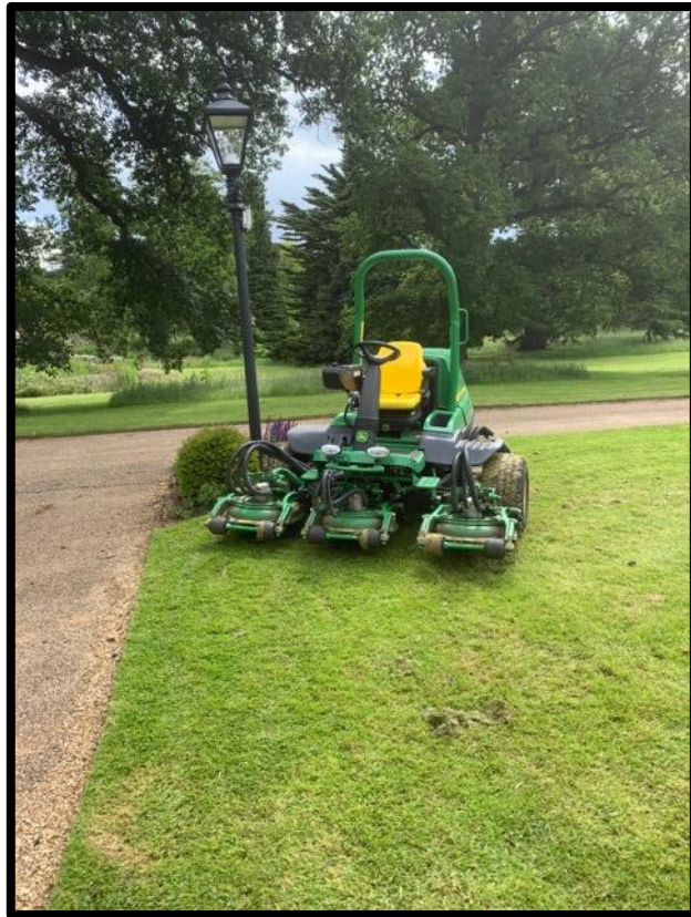
The mower I used each week.