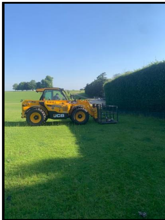
Telehandler mounted basket, used for cutting tall hedges out of.