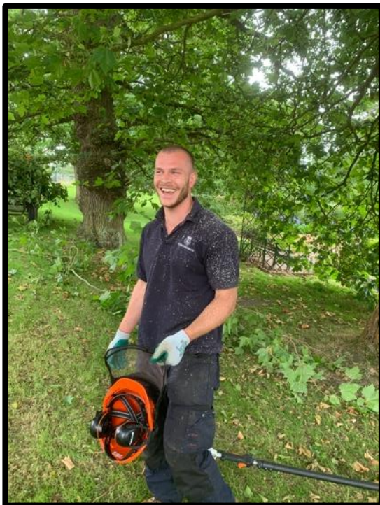
Clearly enjoying it.