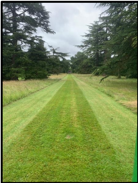
Lawn stripes done by yours truly.