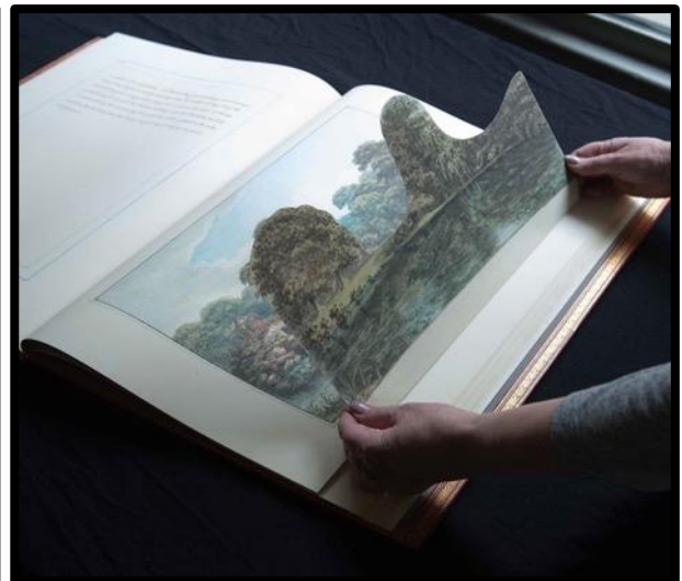
The Woburn Red Book