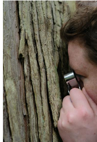
Figure 3 Translocation of Pseudocyphellaria intricata on Corylus avellana in Benmore BG