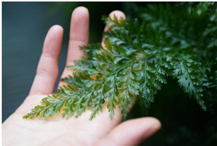
Figure 1 Hiro and Stevie in the filmy fern house