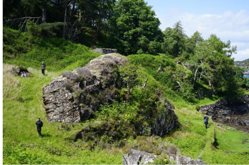
Figure 8 Nigel and Dan Brown scaling hillside woodland and ravines on Eilean Shona Figure 9 The Browns exploring different environmental niches on Eilean Shona

Eilean Shona is a 1,300 acre tidal island on the west coast of Scotland. It is privately owned, with a small population of 4 people living on the island year-round, 2 of which are dear friends. For 8 months of the year the 8 cottages on Eilean Shona provide luxury tourism for a maximum of 30 people at a time making it a place with a much lower footfall than the other gardens visited. In March 2023, I visited my friends and was told of a temperate rainforest that existed there. So excitedly we walked to it, but with my limited knowledge of this ecosystem at the time I questioned, “could it really be a temperate rainforest?”. There are no official plant records on the island, aside from a few species recorded by the British Bryology Society, but there are historical signs of botanical appreciation. A tree trail has been made around previous island owner Captain Swinburne’s pines brought back from his travels. Among these are Tsuga dumosa and Abies grandis .