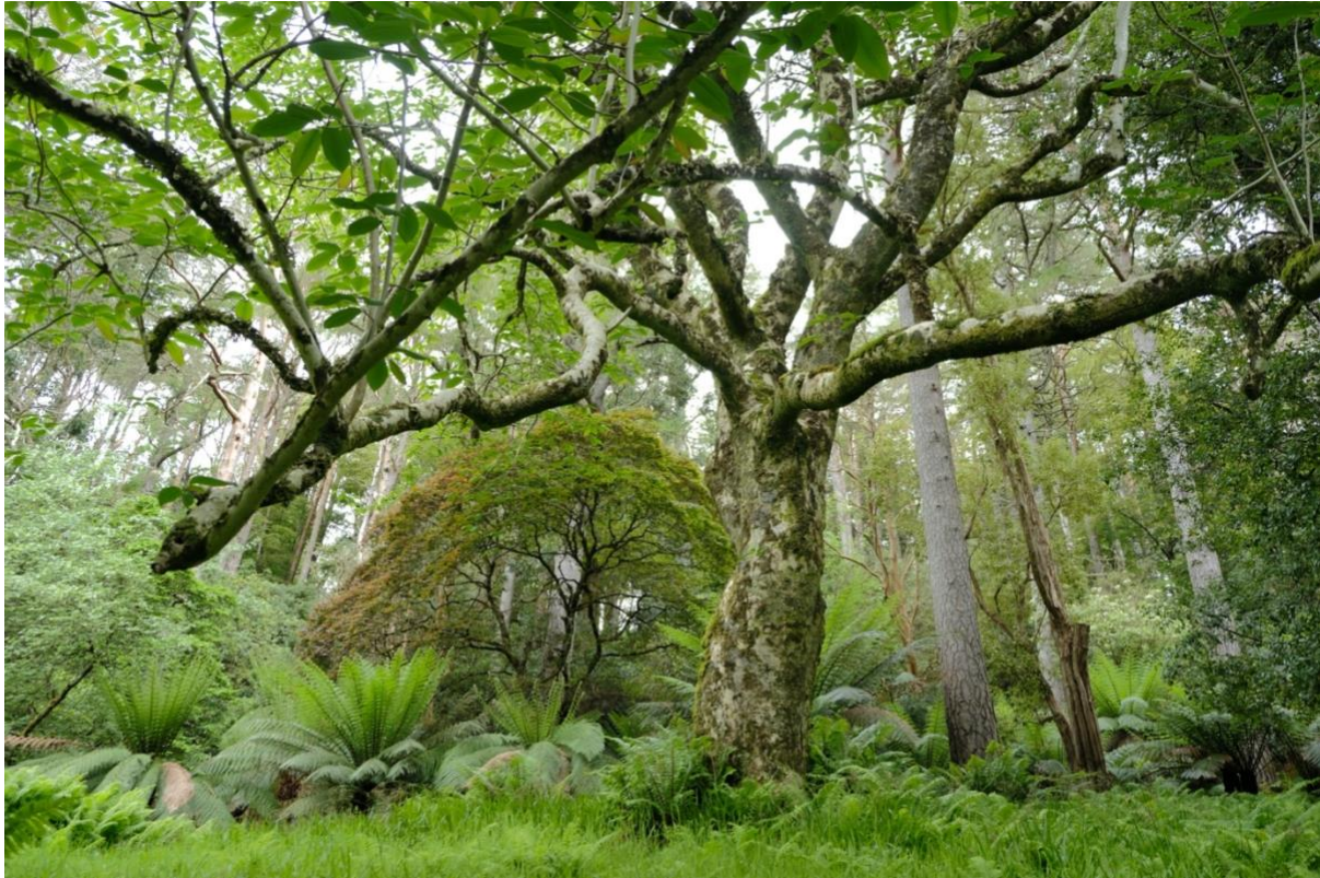
Figure 6 Magnolia Campbellii covered in multiple different species of lichen in Inverewe garden (above) Figure 7 Quercus cerris 'Variegata' with epiphytic ferns and lichen growing under its dappled canopy (below)

advocate for any non-native tree species to be planted in native woodlands, we could consider species whose characteristics lend itself to adding value rather than taking. Magnolia campbellii is quick growing but doesn't spread quickly, reducing its risk of being invasive. With its wide-open canopy, light filters through a structure of horizontal bows which create the ideal habitat for mosses and lichen to grow. Other examples we saw included Leptospermum grandiflorum , a mountain tea tree from Tasmania, dressed with Parmeliella parvula and Nephroma laevigatum , and Quercus cerris 'Variegata', a Turkey oak whose variegated leaves allow more light into the canopy while retaining humidity.